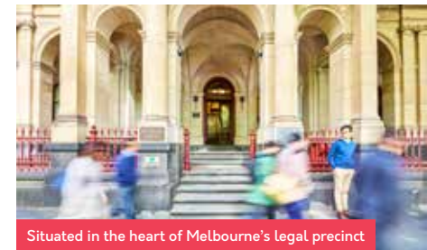
Situated in the heart of Melbourne's legal precinct

FOR MORE INFORMATION PLEASE CONTACT THE EXCLUSIVE SALES AND MARKETING AGENTS: