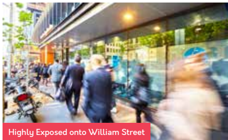
Highly Exposed onto William Street