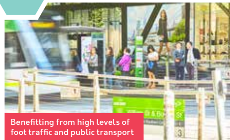
Benefitting from high levels of foot traffic and public transport