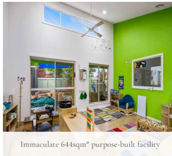
Immaculate 644sqm* purpose-built facility