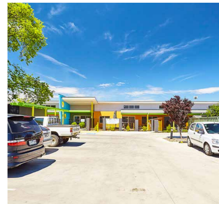
Attractive tax saving depreciation benefits