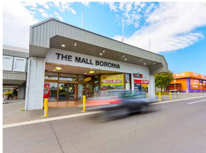
642sqm* in the bustling and active Boronia Mall