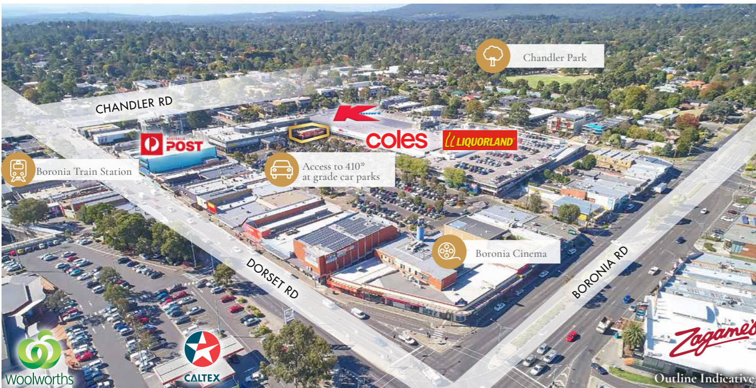
Established Pharmacy in the growing Boronia Mall