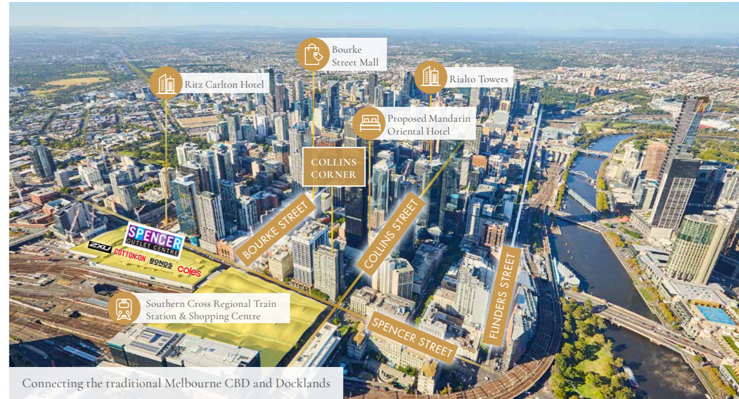
Connecting the traditional Melbourne CBD and Docklands