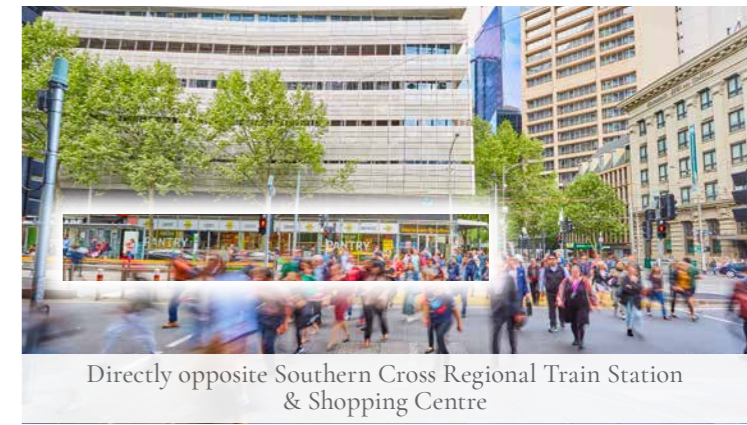
Directly opposite Southern Cross Regional Train Station & Shopping Centre