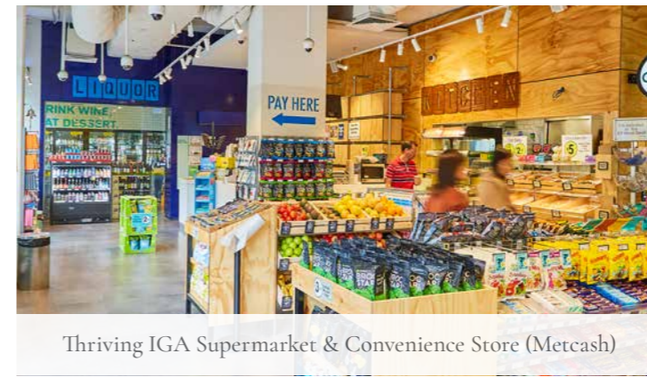
Thriving IGA Supermarket & Convenience Store (Metcash)