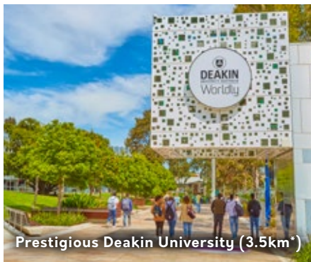
Prestigious Deakin University (3.5km*)