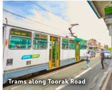
Trams along Toorak Road