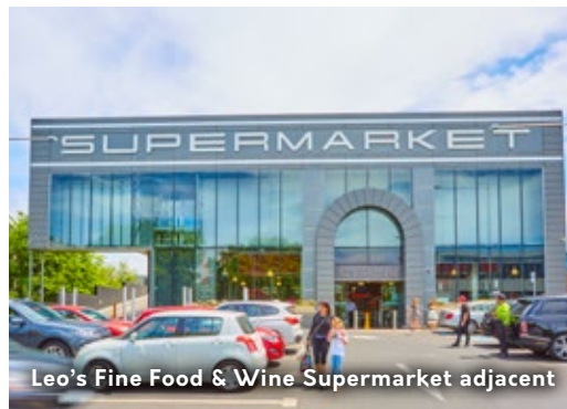
Leo's Fine Food & Wine Supermarket adjacent