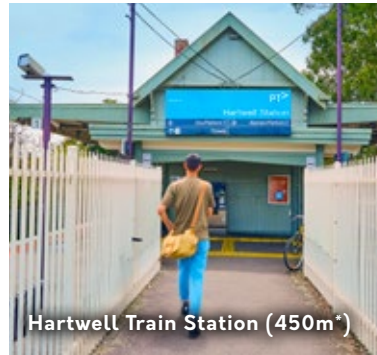
Hartwell Train Station (450m*)