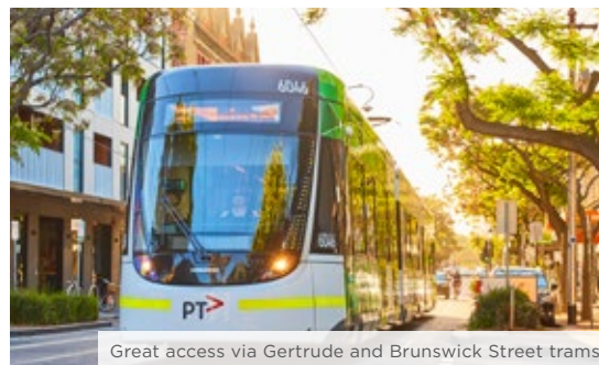
Great access via Gertrude and Brunswick Street trams