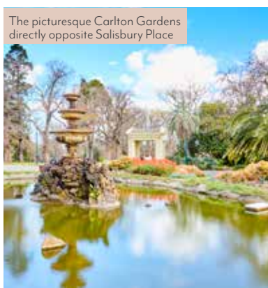
The picturesque Carlton Gardens directly opposite Salisbury Place