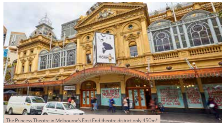
The Princess Theatre in Melbourne's East End theatre district only 450m*