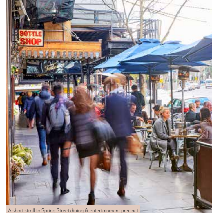
A short stroll to Spring Street dining & entertainment precinct