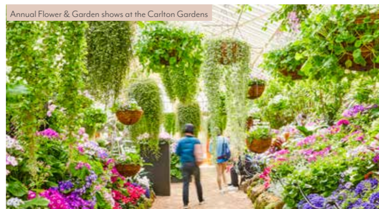
Annual Flower & Garden shows at the Carlton Gardens