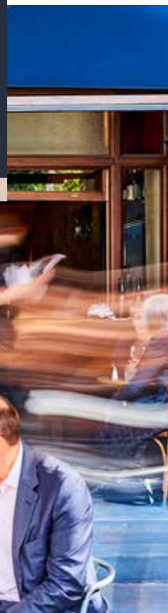
Fantastic cafes & restaurants on Spring Street, Melbourne CBD

Existing improvements of two double-storey houses with period façade generating strong income