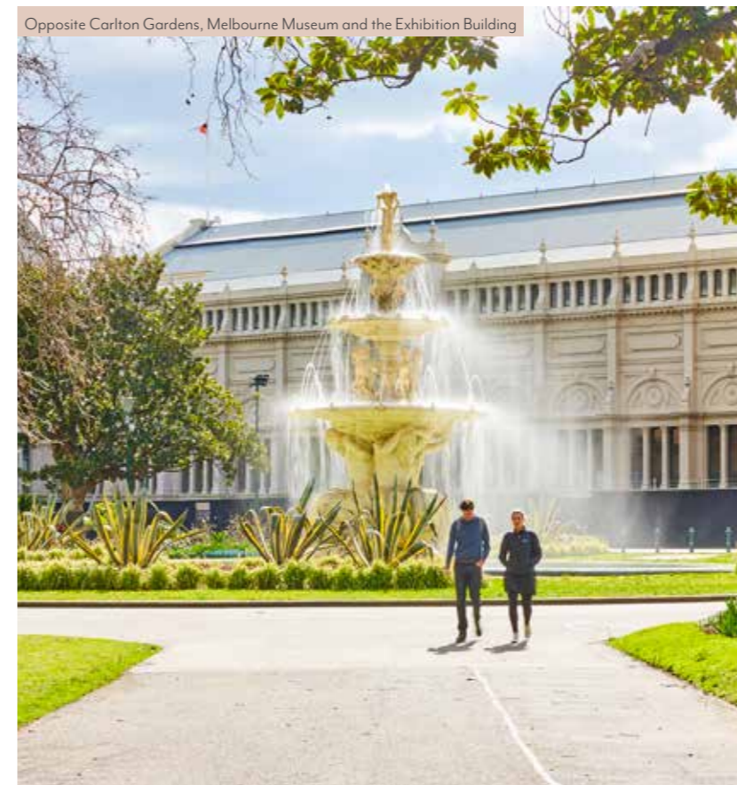
Opposite Carlton Gardens, Melbourne Museum and the Exhibition Building