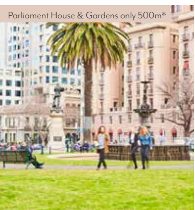
Parliament House & Gardens only 500m*