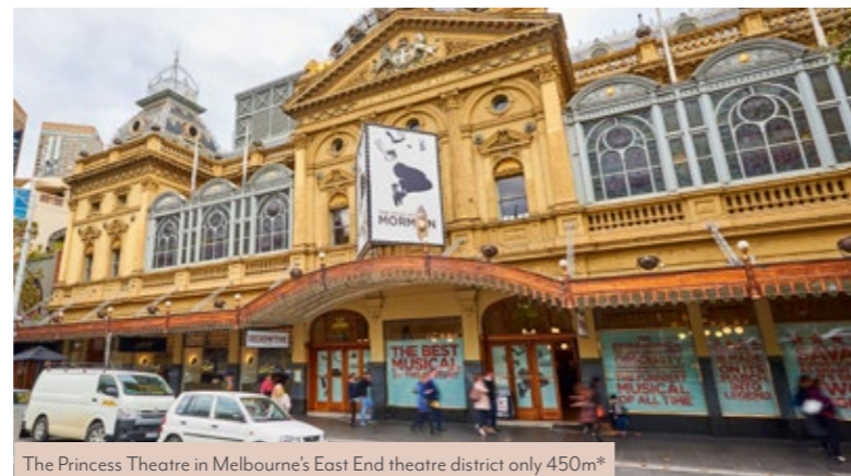
The Princess Theatre in Melbourne's East End theatre district only 450m*