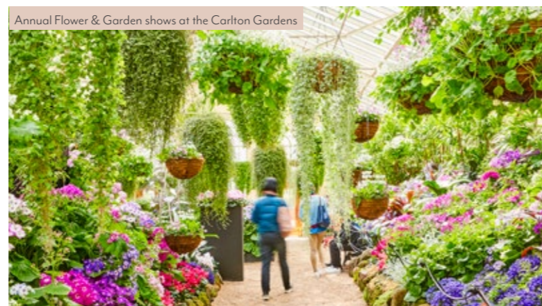
Annual Flower & Garden shows at the Carlton Gardens