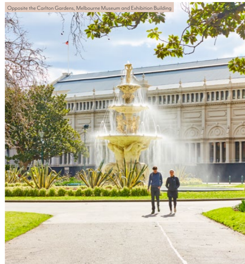
Opposite the Carlton Gardens, Melbourne Museum and Exhibition Building