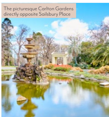
The picturesque Carlton Gardens directly opposite Sailsbury Place