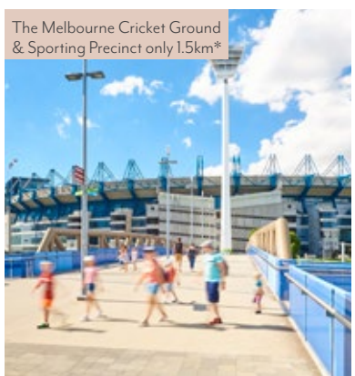
The Melbourne Cricket Ground & Sporting Precinct only 1.5km*