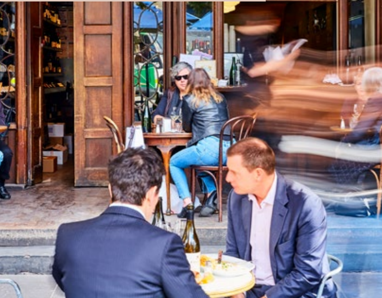
Fantastic cafes & restaurants on Spring St, Melbourne CBD

High quality tertiary education in close proximity: Australian Catholic University (600m*), the Royal Australasian College of Surgeons (450m*), world-renowned University of Melbourne (1km*) and RMIT University (800m*).