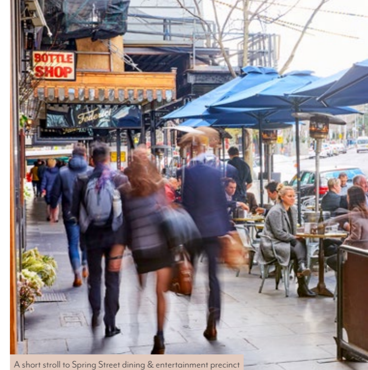
A short stroll to Spring Street dining & entertainment precinct

Existing improvements of two double-storey houses with period façade generating strong income