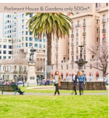
Parliament House & Gardens only 500m*