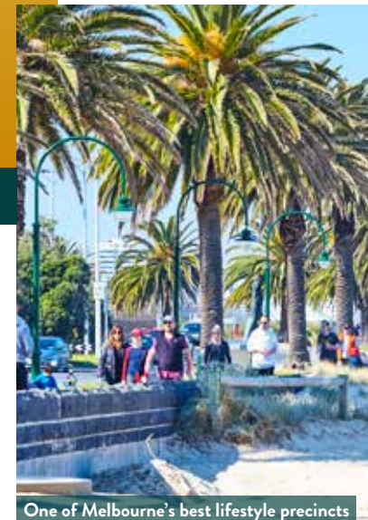
One of Melbourne's best lifestyle precincts

Booming local trade supported by an affluent demographic residing in a number of surrounding high density, luxury residential developments