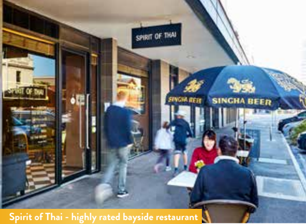
Spirit of Thai - highly rated bayside restaurant