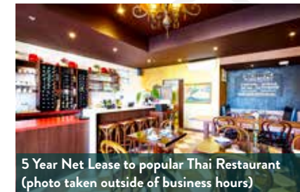
5 Year Net Lease to popular Thai Restaurant (photo taken outside of business hours)