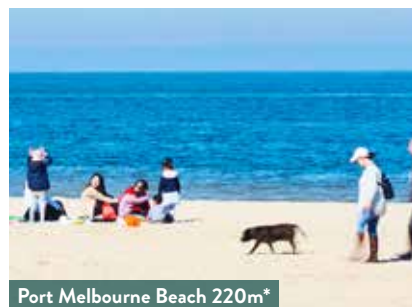
Port Melbourne Beach 220m*