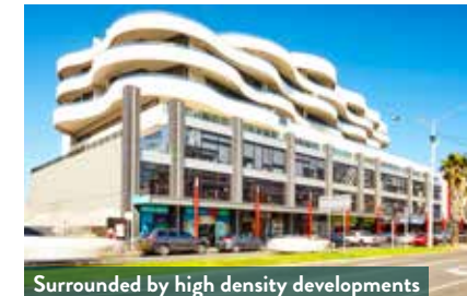
Surrounded by high density developments