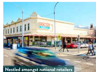
Nestled amongst national retailers