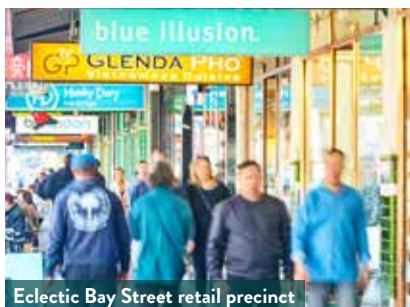
Eclectic Bay Street retail precinct