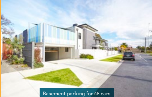
Basement parking for 28 cars