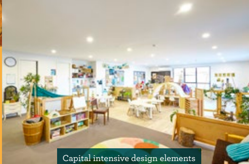
Capital intensive design elements