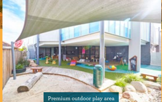
Premium outdoor play area