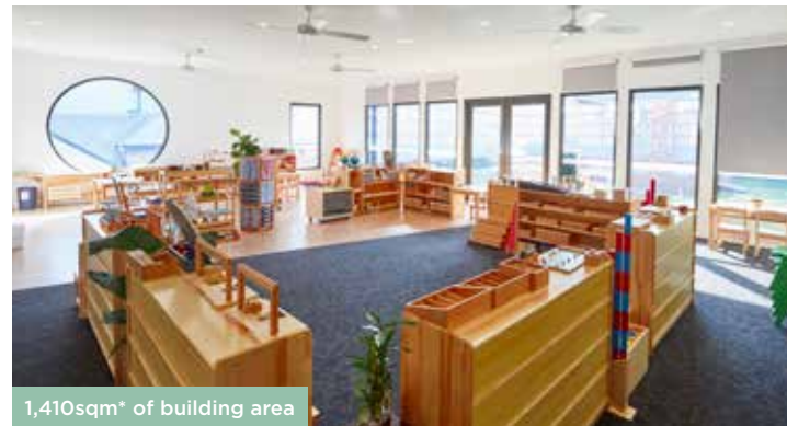
1,410sqm* of building area