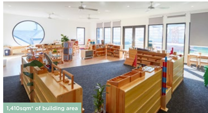
1,410sqm* of building area