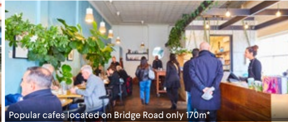
Popular cafes located on Bridge Road only 170m*