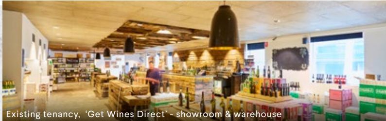
Existing tenancy, 'Get Wines Direct' - showroom & warehouse