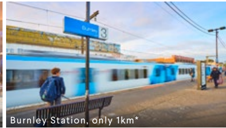
Burnley Station, only 1km*