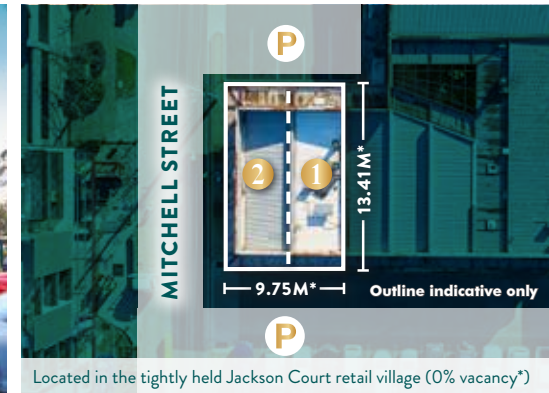
Located in the tightly held Jackson Court retail village (0% vacancy*)

TO BE SOLD INDIVIDUALLY VIA PUBLIC ON-SITE AUCTIONS 20TH SEPTEMBER 2018 FROM 10.30AM