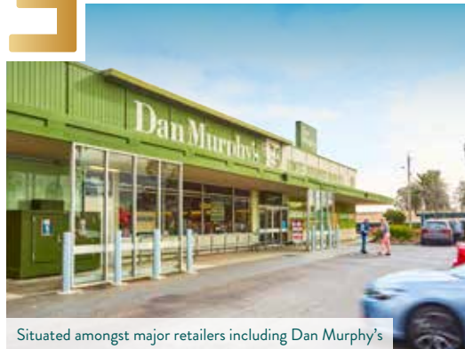
Situated amongst major retailers including Dan Murphy's

DONCASTER MEDIAN HOUSE PRICE $1,402,500*