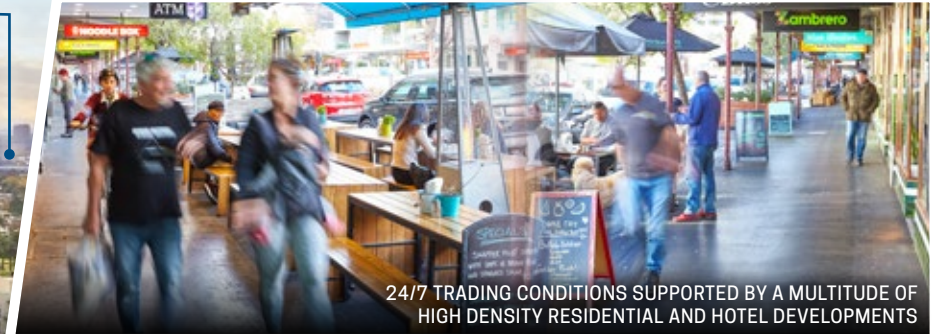
24/7 TRADING CONDITIONS SUPPORTED BY A MULTITUDE OF HIGH DENSITY RESIDENTIAL AND HOTEL DEVELOPMENTS