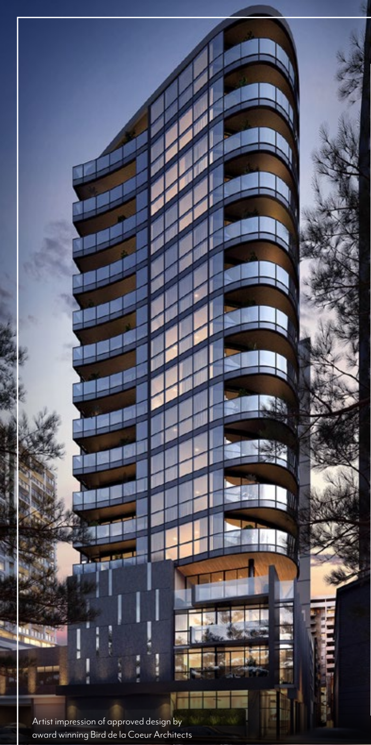
Artist impression of approved design by award winning Bird de la Coeur Architects