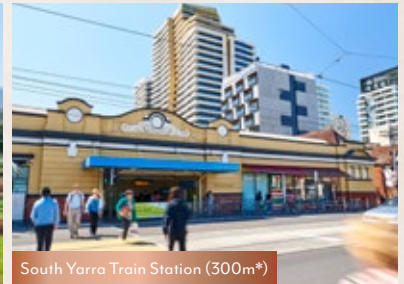
South Yarra Train Station (300m*)