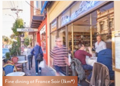
Fine dining at France Soir (1km*)