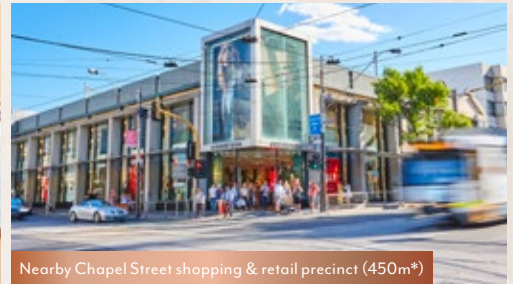
Nearby Chapel Street shopping & retail precinct (450m*)