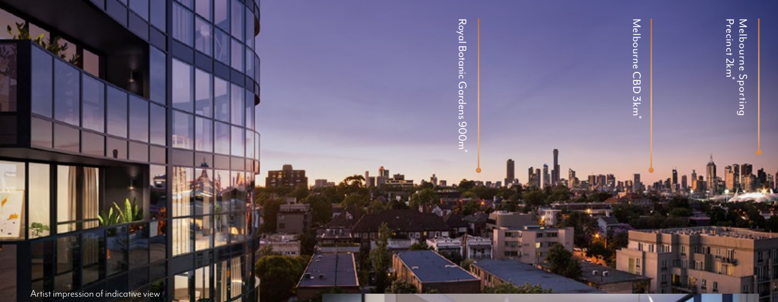
Artist impression of indicative view