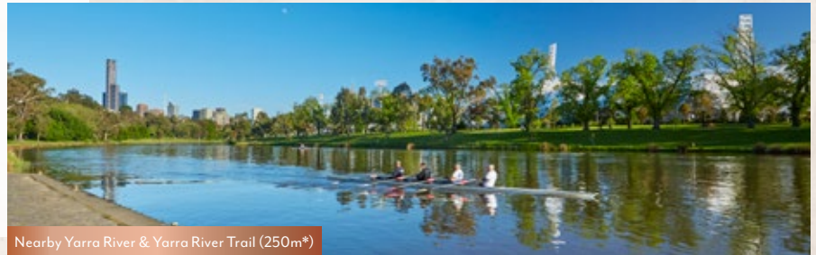
Nearby Yarra River & Yarra River Trail (250m*)

FOR FURTHER INFORMATION, PLEASE CONTACT THE EXCLUSIVE SALES AND MARKETING AGENTS: