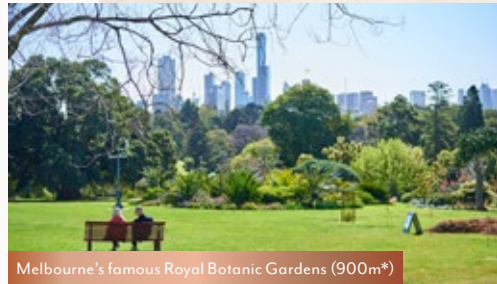
Melbourne's famous Royal Botanic Gardens (900m*)

Less than 350m* to South Yarra Train Station & Toorak Road trams, providing direct Melbourne CBD access (only 3km*)