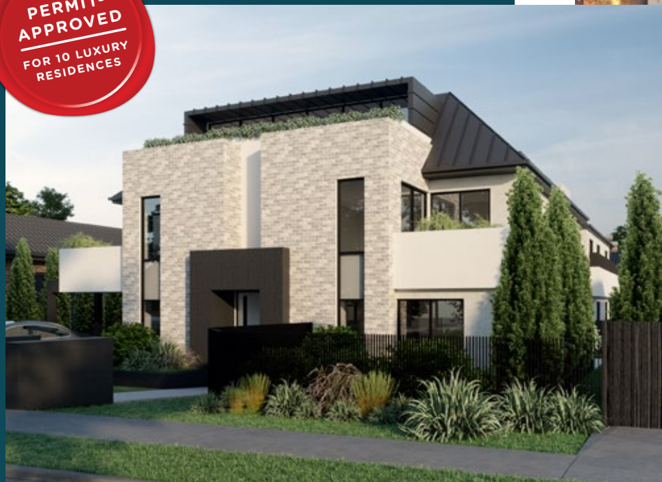
Artist impression of future development