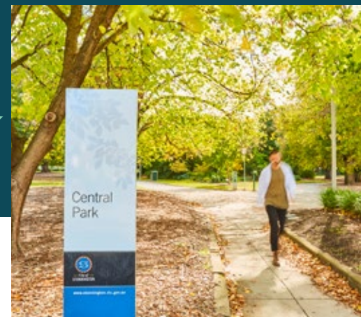
A short stroll away from the serene Central Park

FOR SALE VIA PUBLIC ON-SITE AUCTION THURSDAY 28TH JUNE 2018 AT 2.30PM