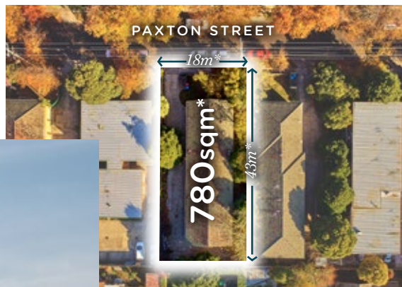
Outline indicative only

Permit-approved luxury development for 10 high-end residences