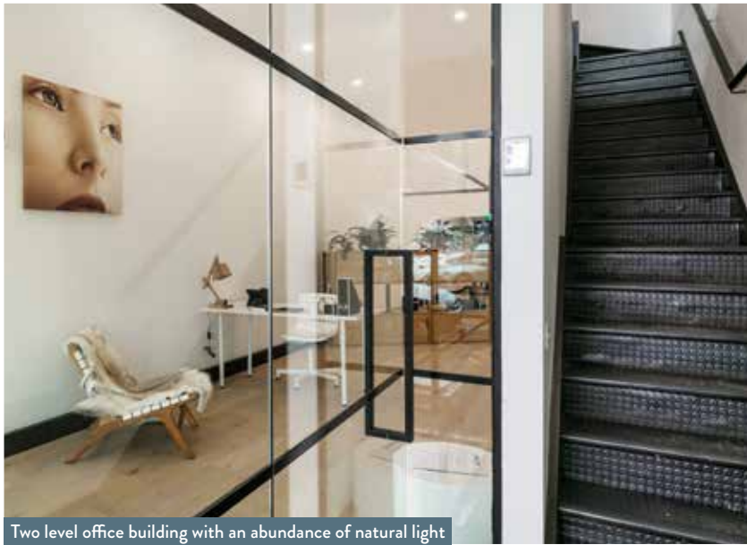
Two level office building with an abundance of natural light