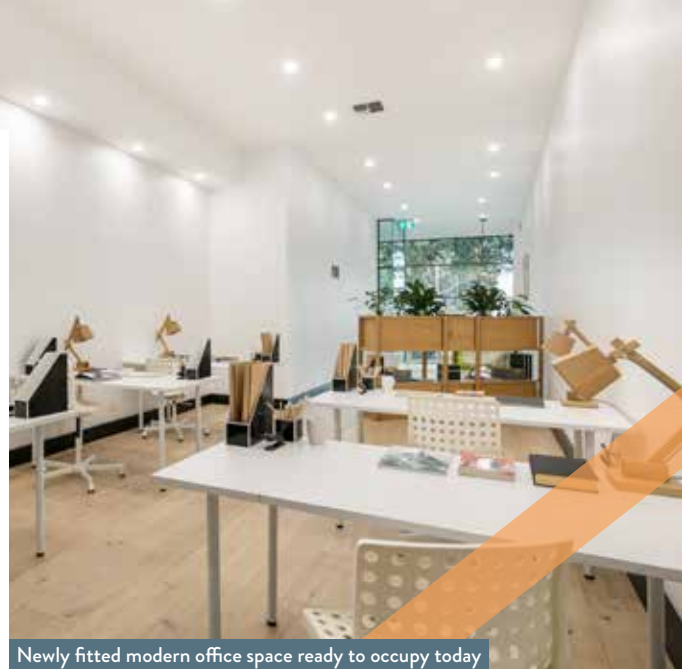
Newly fitted modern office space ready to occupy today