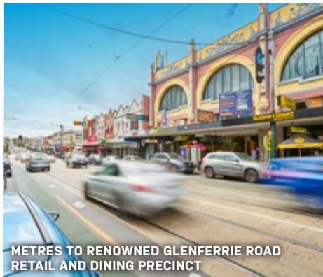
METRES TO RENOWNED GLENFERRIE ROAD RETAIL AND DINING PRECINCT