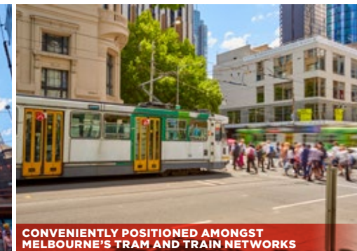
CONVENIENTLY POSITIONED AMONGST MELBOURNE'S TRAM AND TRAIN NETWORKS

FOR MORE INFORMATION PLEASE CONTACT THE EXCLUSIVE SALES AND MARKETING AGENTS: