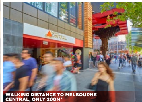
WALKING DISTANCE TO MELBOURNE CENTRAL, ONLY 200M*