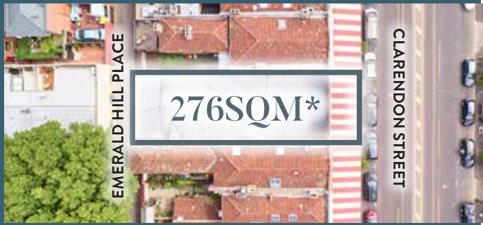
Under-developed dual fronted landholding of 276sqm

FOR SALE VIA PUBLIC ON-SITE AUCTION THURSDAY 29TH MARCH 2018 AT 12.30PM