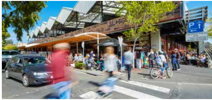
Close to iconic South Melbourne Market