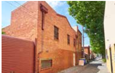
Complimentary Rear laneway access

FOR SALE VIA PUBLIC ON-SITE AUCTION THURSDAY 29TH MARCH 2018 AT 12.30PM