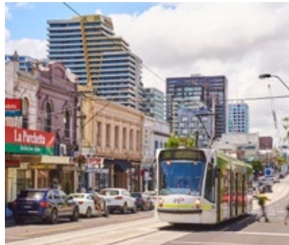
PRESTIGIOUS TOORAK ROAD LOCATION