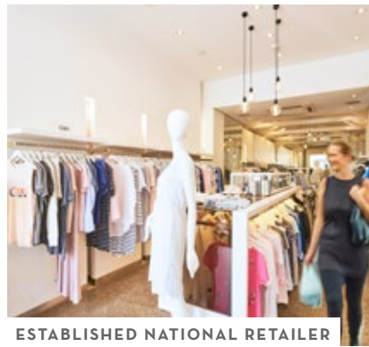
ESTABLISHED NATIONAL RETAILER