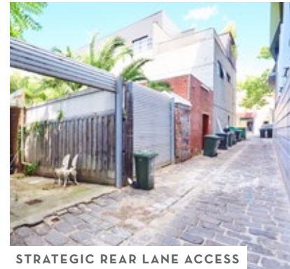
STRATEGIC REAR LANE ACCESS

5 year net lease providing annual income of $70,000* + GST + Outgoings and fixed rental increases