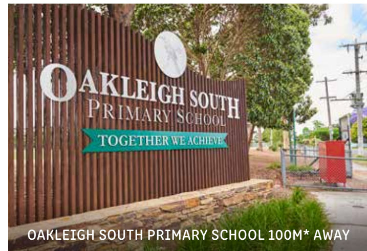
OAKLEIGH SOUTH PRIMARY SCHOOL 100M* AWAY