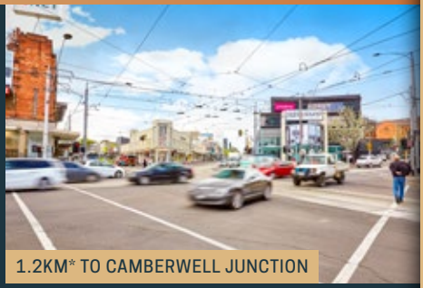
1.2KM* TO CAMBERWELL JUNCTION

FOR MORE INFORMATION PLEASE CONTACT THE EXCLUSIVE SALES AND MARKETING AGENTS: