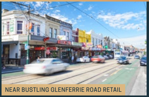
NEAR BUSTLING GLENFERRIE ROAD RETAIL