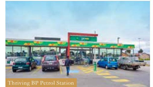
Thriving BP Petrol Station