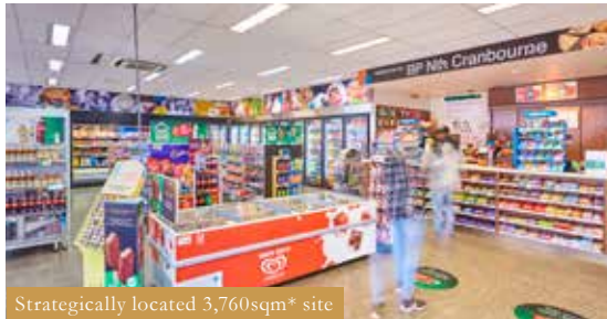
Strategically located 3,760sqm* site

“Cranbourne is one of the fastest growing suburbs in metropolitan Melbourne – BP Cranbourne gives investors the opportunity to take advantage of that”