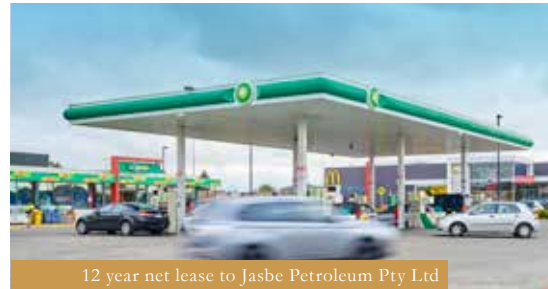
12 year net lease to Jasbe Petroleum Pty Ltd