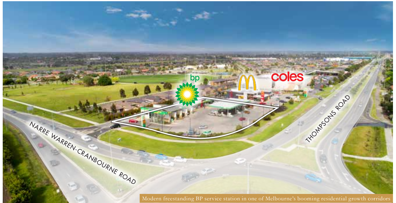
Modern freestanding BP service station in one of Melbourne’s booming residential growth corridors

“Cranbourne is one of the fastest growing suburbs in metropolitan Melbourne – BP Cranbourne gives investors the opportunity to take advantage of that”