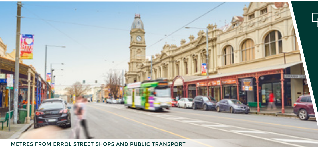
METRES FROM ERROL STREET SHOPS AND PUBLIC TRANSPORT