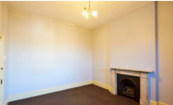
MULTIPLE ROOMS WITH FLEXIBLE FLOOR PLAN