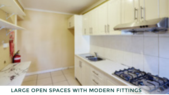
LARGE OPEN SPACES WITH MODERN FITTINGS