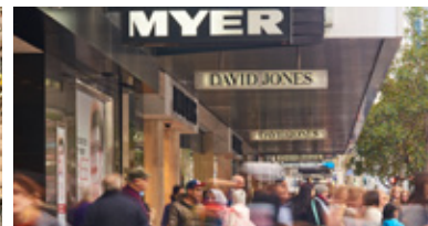
IN THE HEART OF THE CBD RETAIL CORE