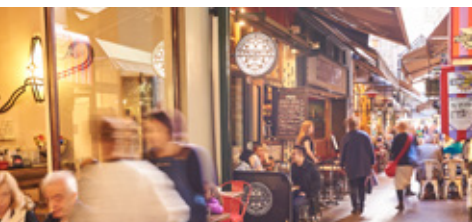
ACCESS TO MELBOURNE'S ICONIC LANEWAY CAFÉS AND RESTAURANTS