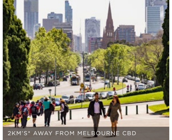
2KM'S* AWAY FROM MELBOURNE CBD