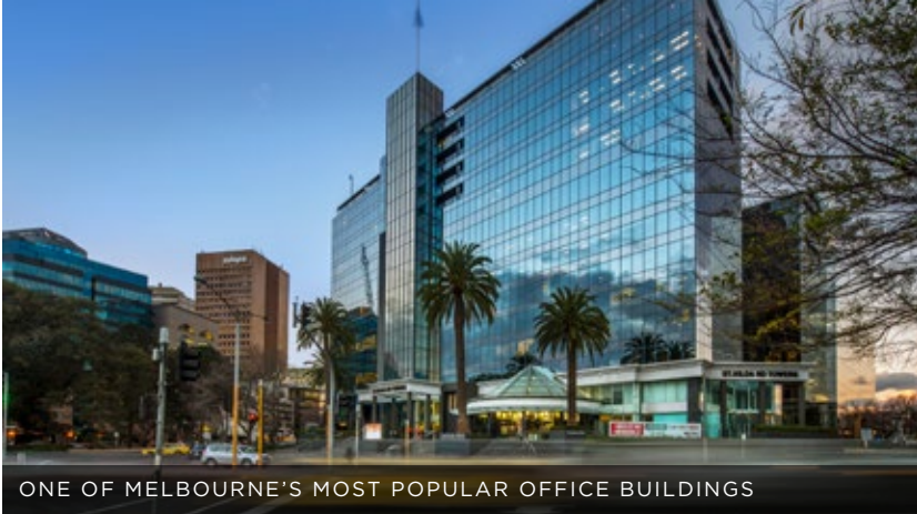
ONE OF MELBOURNE'S MOST POPULAR OFFICE BUILDINGS