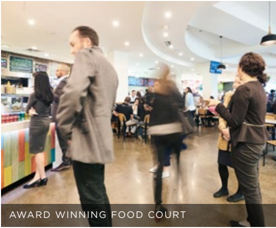
AWARD WINNING FOOD COURT