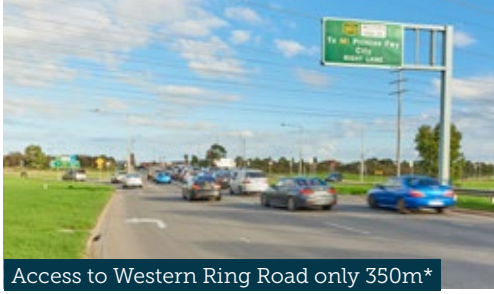
Access to Western Ring Road only 350m*