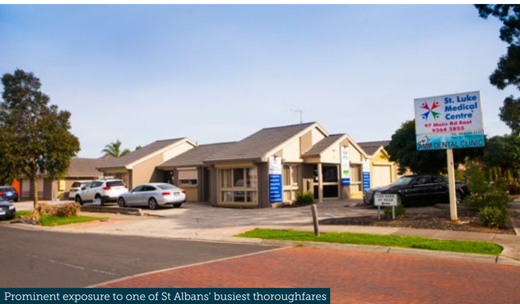
Prominent exposure to one of St Albans' busiest thoroughfares