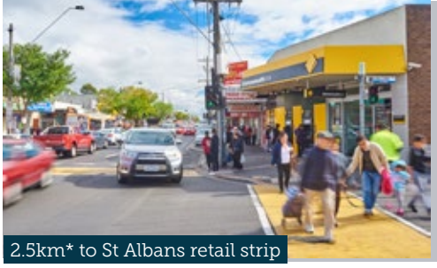
2.5km* to St Albans retail strip