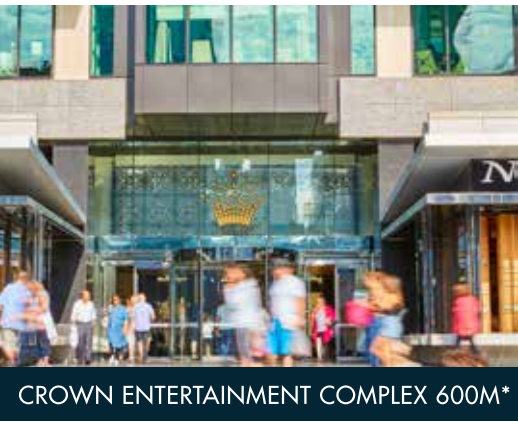
CROWN ENTERTAINMENT COMPLEX 600M*

FOR MORE INFORMATION PLEASE CONTACT THE EXCLUSIVE SALES AND MARKETING AGENTS: