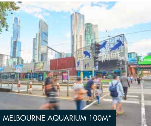
MELBOURNE AQUARIUM 100M*

An additional 20sqm* studio apartment on title with enormous rental potential