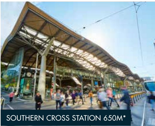
SOUTHERN CROSS STATION 650M*