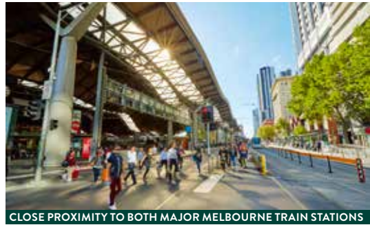
CLOSE PROXIMITY TO BOTH MAJOR MELBOURNE TRAIN STATIONS