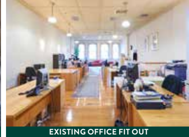
EXISTING OFFICE FIT OUT