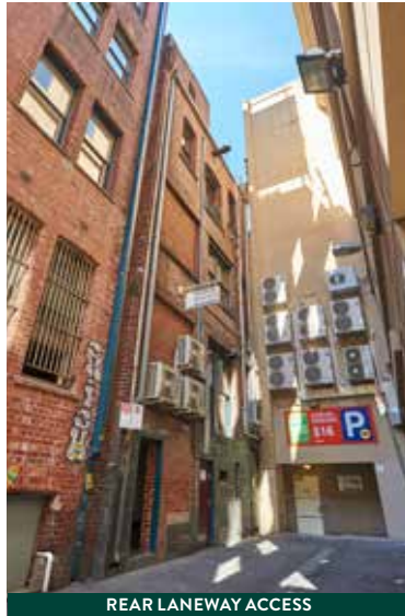
REAR LANEWAY ACCESS