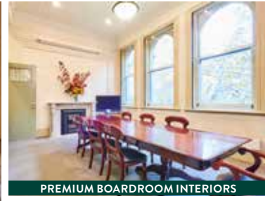
PREMIUM BOARDROOM INTERIORS