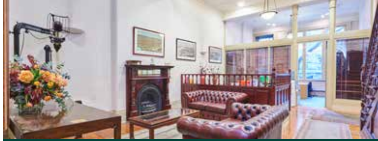
CLASSICALLY DESIGNED INTERIORS WITH SUBSTANTIAL KING STREET FRONTAGE

Metres away from Southbank's Crown Casino retail and hospitality and direct access to all forms of parking and public transport amenity in Southern Cross Station, Flinders Street Station and super tram stop