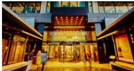
650M* FROM SOUTHBANK'S CROWN CASINO AND ENTERTAINMENT COMPLEX