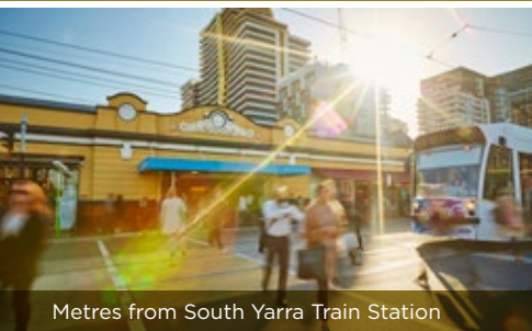
Metres from South Yarra Train Station

FORTHCOMING AUCTION: DATE TO BE CONFIRMED