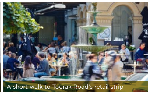
A short walk to Toorak Road's retail strip