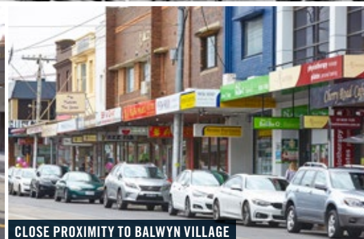
CLOSE PROXIMITY TO BALWYN VILLAGE