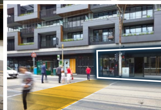
PEDESTRIAN CROSSING DIRECTLY OUTSIDE