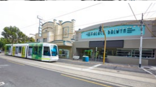
SERVICED BY PUBLIC TRANSPORT AND DIRECTLY OPPOSITE THE NEWLY RENOVATED PALACE BALWYN CINEMA

An exclusive and desirable inner-east suburb close to an endless list of distinguished private schools, large retailers and state of the art recreational facilities