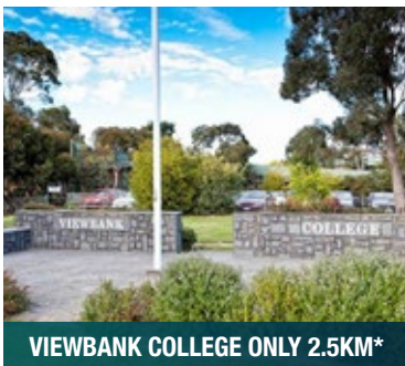
VIEWBANK COLLEGE ONLY 2.5KM*