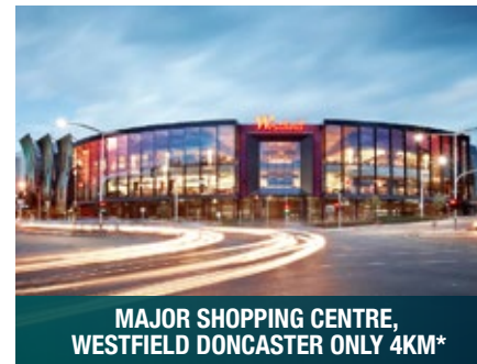
MAJOR SHOPPING CENTRE, WESTFIELD DONCASTER ONLY 4KM*

FOR MORE INFORMATION PLEASE CONTACT THE EXCLUSIVE SALES AND MARKETING AGENTS: