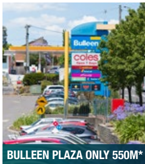
BULLEEN PLAZA ONLY 550M*