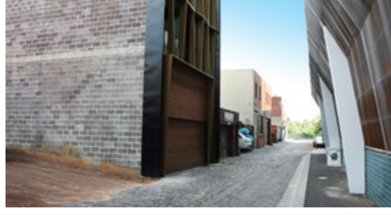
REAR LANEWAY ACCESS VIA ELGIN PLACE