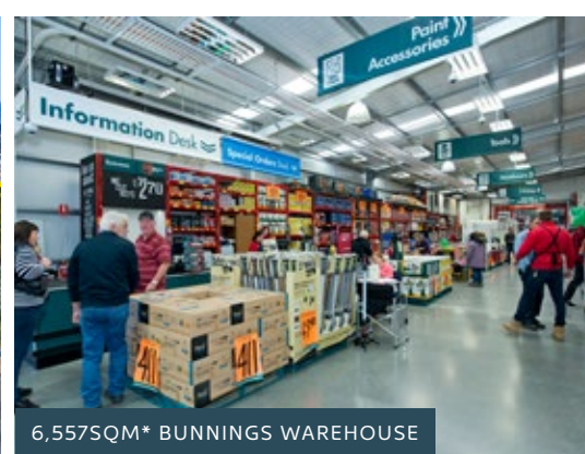
6,557SQM* BUNNINGS WAREHOUSE