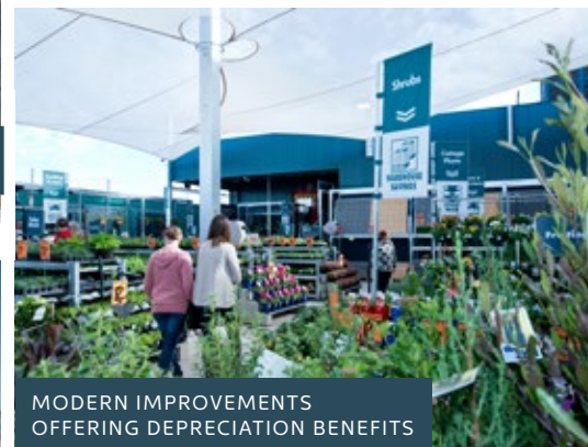
MODERN IMPROVEMENTS OFFERING DEPRECIATION BENEFITS