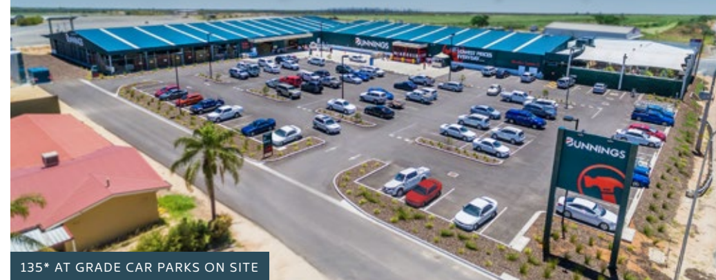
135* AT GRADE CAR PARKS ON SITE

“Bunnings is continuing to grow rapidly with over 11% in revenue growth over the past 2 years”