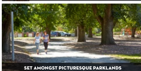
SET AMONGST PICTURESQUE PARKLANDS