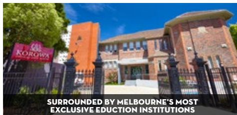
SURROUNDED BY MELBOURNE'S MOST EXCLUSIVE EDUCATION INSTITUTIONS