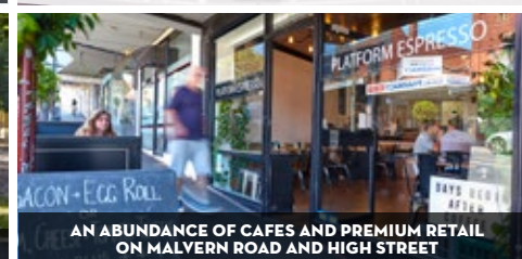
AN ABUNDANCE OF CAFES AND PREMIUM RETAIL ON MALVERN ROAD AND HIGH STREET