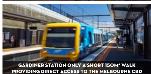
GARDINER STATION ONLY A SHORT 150M* WALK PROVIDING DIRECT ACCESS TO THE MELBOURNE CBD