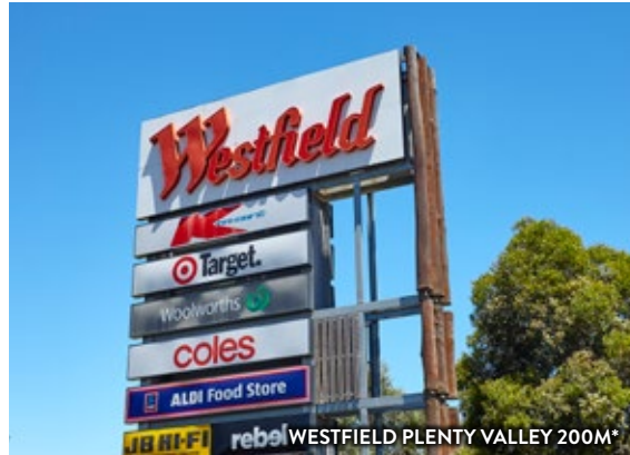
WESTFIELD PLENTY VALLEY 200M*