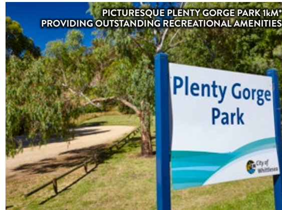
PICTURESQUE PLENTY GORGE PARK 1KM* PROVIDING OUTSTANDING RECREATIONAL AMENITIES