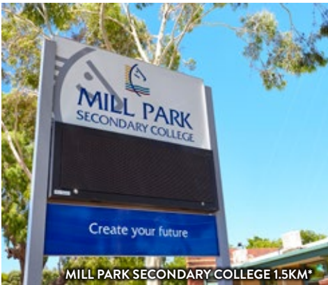
MILL PARK SECONDARY COLLEGE 1.5KM*