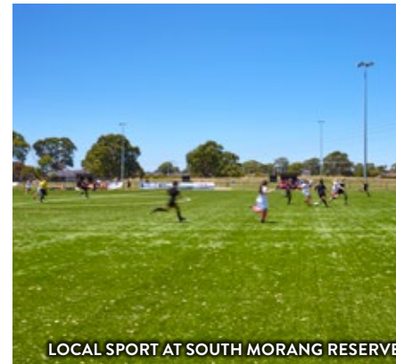
LOCAL SPORT AT SOUTH MORANG RESERVE