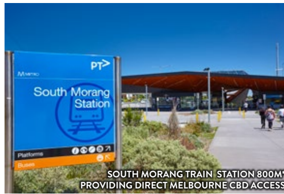
SOUTH MORANG TRAIN STATION 800M* PROVIDING DIRECT MELBOURNE CBD ACCESS