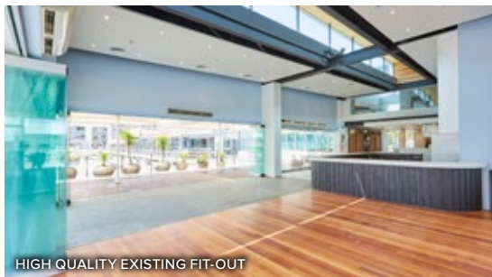
HIGH QUALITY EXISTING FIT-OUT