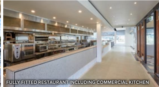
FULLY FITTED RESTAURANT INCLUDING COMMERCIAL KITCHEN