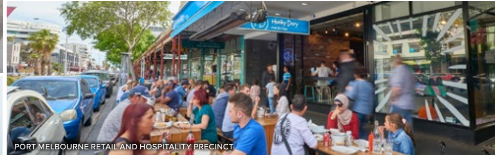
PORT MELBOURNE RETAIL AND HOSPITALITY PRECINCT