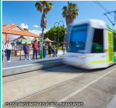
CLOSE PROXIMITY TO PUBLIC TRANSPORT