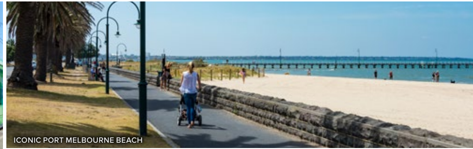
ICONIC PORT MELBOURNE BEACH