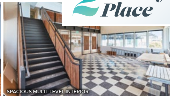
SPACIOUS MULTI-LEVEL INTERIOR