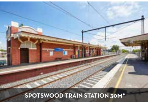
SPOTSWOOD TRAIN STATION 30M*

Large catchment area – Flanked by established residential suburbs of Yarraville (population 14,000+), Newport (population 13,000+) & Williamstown (13,000+)