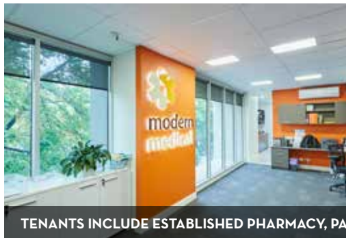
TENANTS INCLUDE ESTABLISHED PHARMACY, PATHOLOGY, GP SERVICES AND MORE