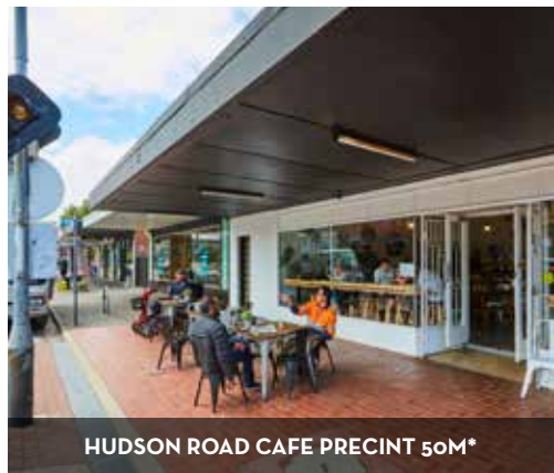
HUDSON ROAD CAFE PRECINCT 50M*