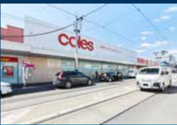
DIRECTLY OPPOSITE COLES SUPERMARKET