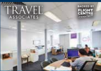
SECURE INCOME FROM 2 TENANTS