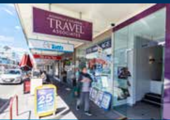
DUAL FRONTAGES ON GLEN HUNTLY ROAD