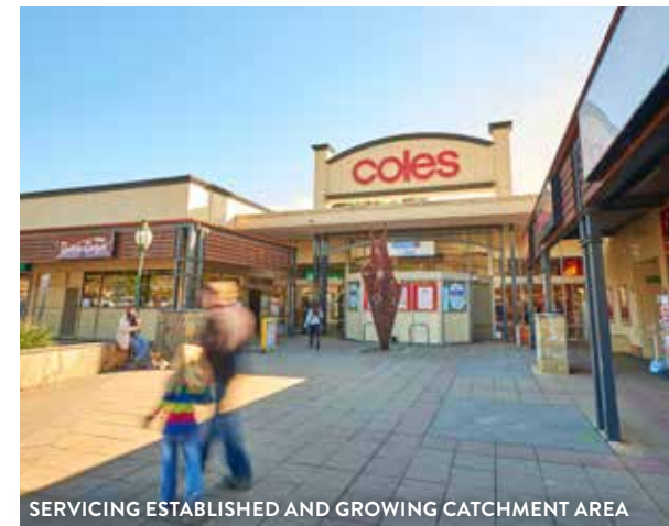
SERVICING ESTABLISHED AND GROWING CATCHMENT AREA