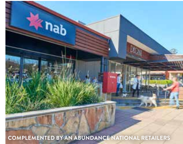
COMPLEMENTED BY AN ABUNDANCE NATIONAL RETAILERS

Fully leased net income of $1,767,393 per annum*