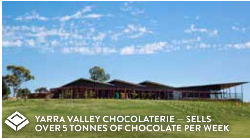
YARRA VALLEY CHOCOLATERIE – SELLS OVER 5 TONNES OF CHOCOLATE PER WEEK