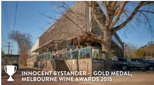
INNOCENT BYSTANDER – GOLD MEDAL, MELBOURNE WINE AWARDS 2015