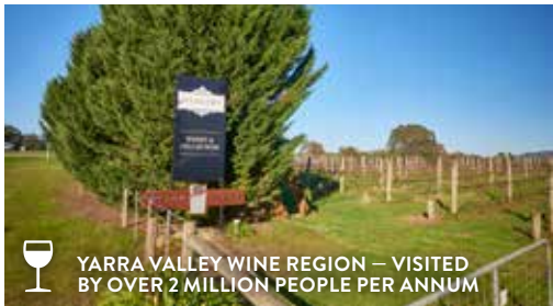
YARRA VALLEY WINE REGION – VISITED BY OVER 2 MILLION PEOPLE PER ANNUM