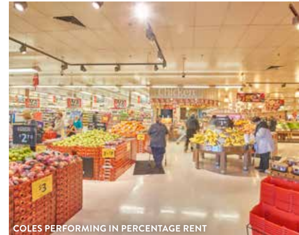
COLES PERFORMING IN PERCENTAGE RENT