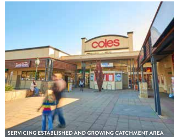
SERVICING ESTABLISHED AND GROWING CATCHMENT AREA