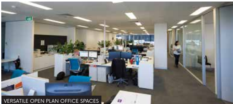
VERSATILE OPEN PLAN OFFICE SPACES