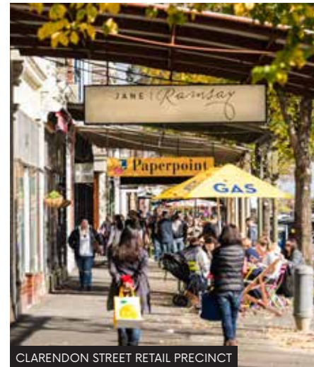
CLARENDON STREET RETAIL PRECINCT