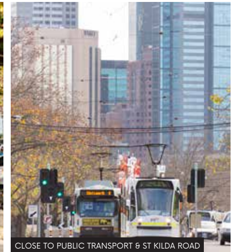
CLOSE TO PUBLIC TRANSPORT & ST KILDA ROAD