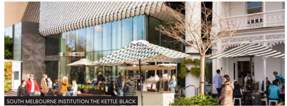
SOUTH MELBOURNE INSTITUTION THE KETTLE BLACK

FOR SALE VIA INTERNATIONAL EXPRESSIONS OF INTEREST CLOSING THURSDAY 20TH OCTOBER 2016 AT 5PM