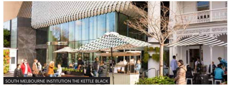
SOUTH MELBOURNE INSTITUTION THE KETTLE BLACK

FOR SALE VIA INTERNATIONAL EXPRESSIONS OF INTEREST CLOSING THURSDAY 20TH OCTOBER 2016 AT 5PM