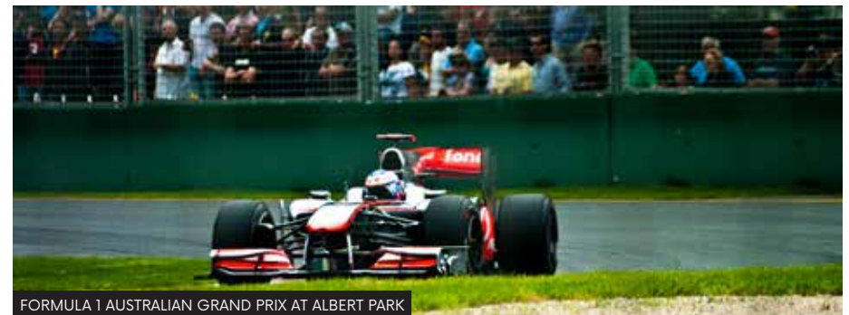
FORMULA 1 AUSTRALIAN GRAND PRIX AT ALBERT PARK

FOR MORE INFORMATION PLEASE CONTACT THE EXCLUSIVE SALES AND MARKETING AGENTS: