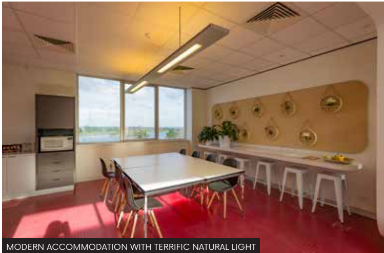
MODERN ACCOMMODATION WITH TERRIFIC NATURAL LIGHT