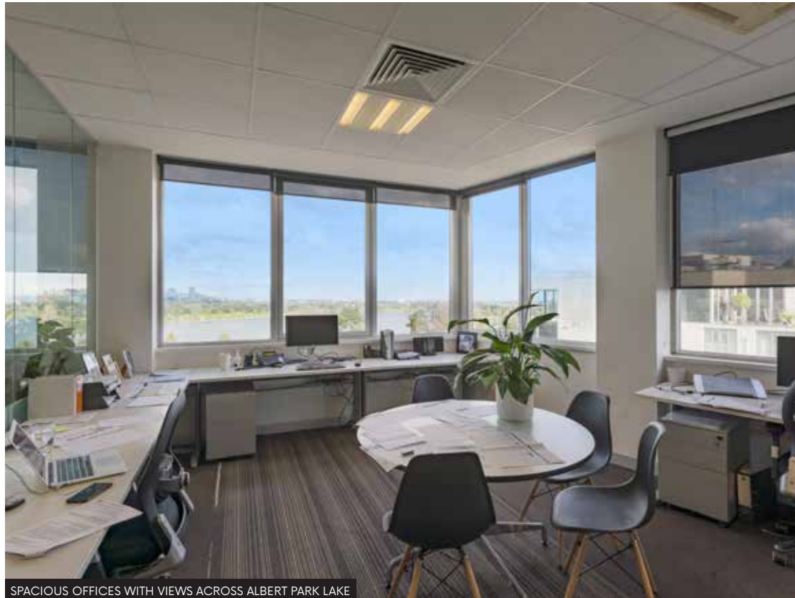
SPACIOUS OFFICES WITH VIEWS ACROSS ALBERT PARK LAKE