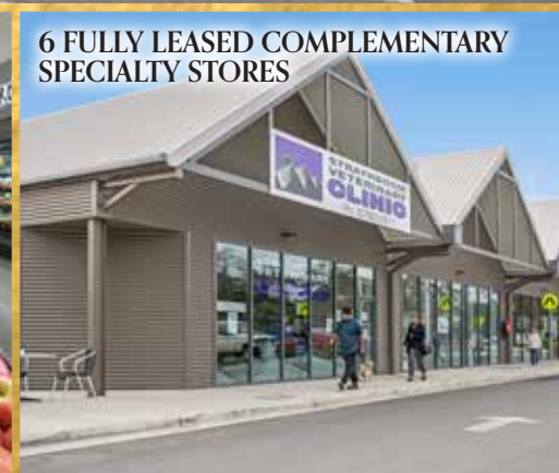
6 FULLY LEASED COMPLEMENTARY SPECIALTY STORES