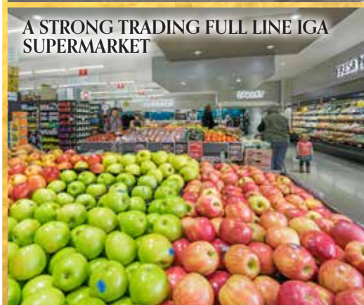
A STRONG TRADING FULL LINE IGA SUPERMARKET

ANCHORED BY A NEW 15 YEAR NET LEASE TO CHAMPIONS SUPA IGA