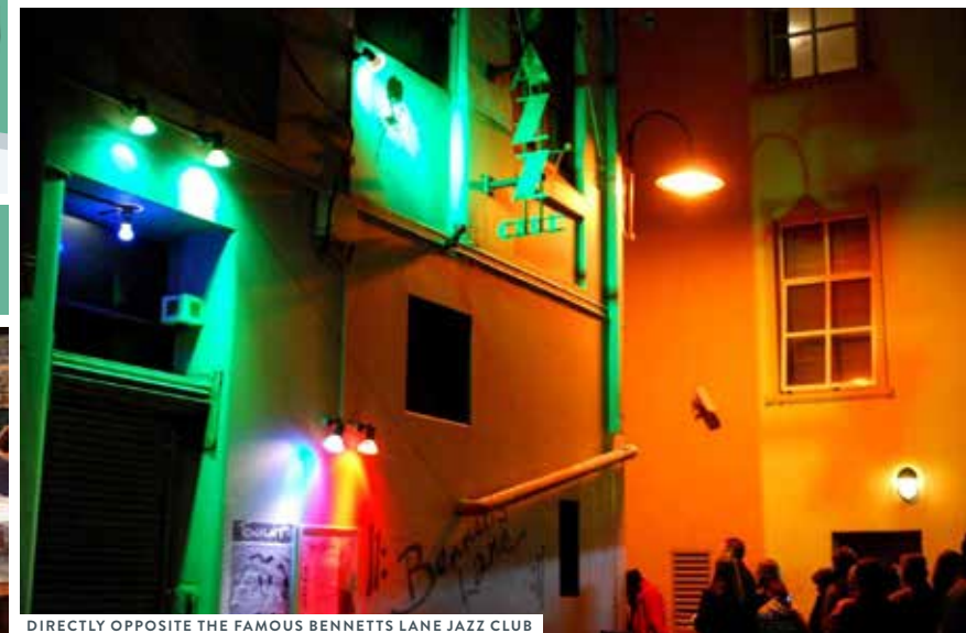
DIRECTLY OPPOSITE THE FAMOUS BENNETTS LANE JAZZ CLUB

PERMIT APPROVED FOR UNREPEATABLE MIXED USE DEVELOPMENT