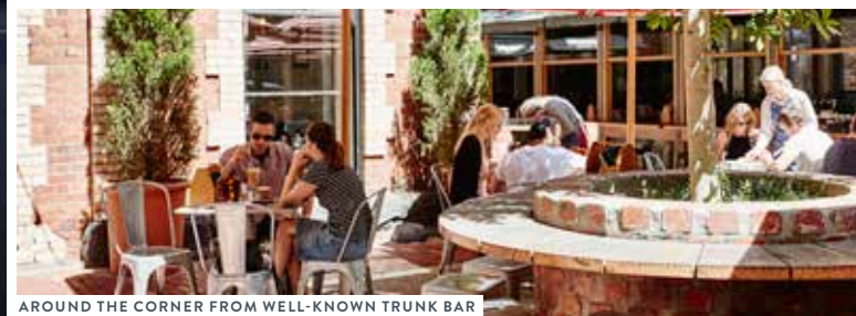
AROUND THE CORNER FROM WELL-KNOWN TRUNK BAR