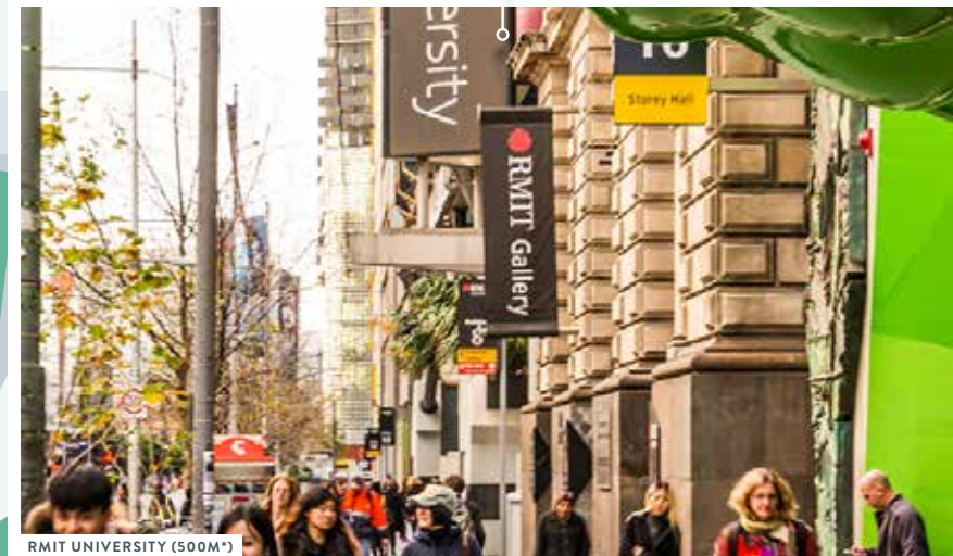
RMIT UNIVERSITY (500M*)

NEARBY ACCESS TO MELBOURNE'S WORLD CLASS UNIVERSITIES