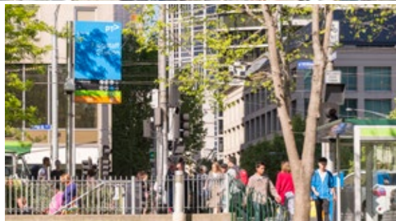
CLOSE PROXIMITY TO PUBLIC TRANSPORT