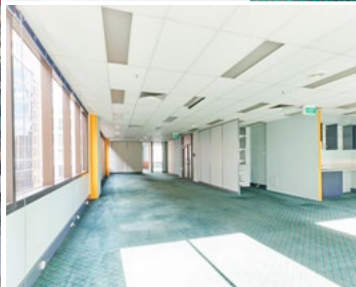
OFFERED WITH VACANT POSSESSION