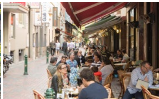
CAFE'S AND AMENITY AT YOUR DOORSTEP

FOR FURTHER INFORMATION OR TO ARRANGE AN INSPECTION PLEASE CONTACT THE EXCLUSIVE SALES AGENTS: