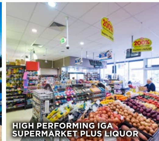
HIGH PERFORMING IGA SUPERMARKET PLUS LIQUOR

FOR MORE INFORMATION PLEASE CONTACT THE EXCLUSIVE SALES AND MARKETING AGENTS: