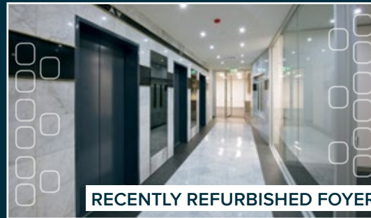
RECENTLY REFURBISHED FOYER