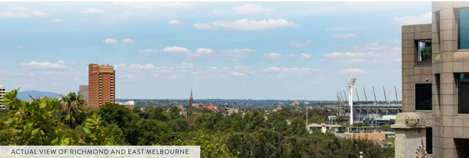
ACTUAL VIEW OF RICHMOND AND EAST MELBOURNE