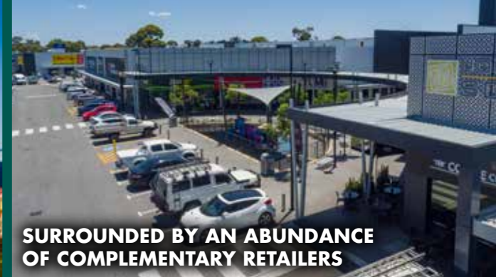
SURROUNDED BY AN ABUNDANCE OF COMPLEMENTARY RETAILERS