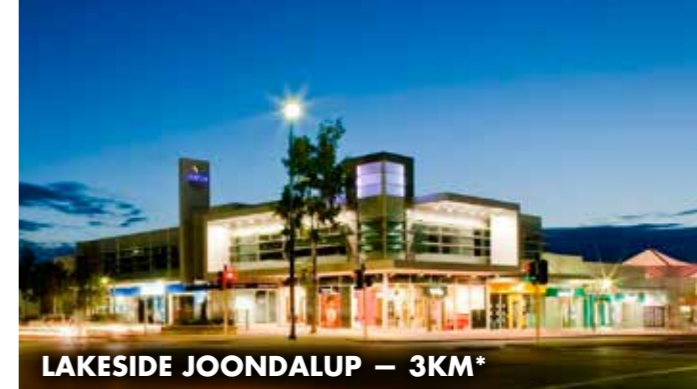
LAKESIDE JOONDALUP — 3KM*